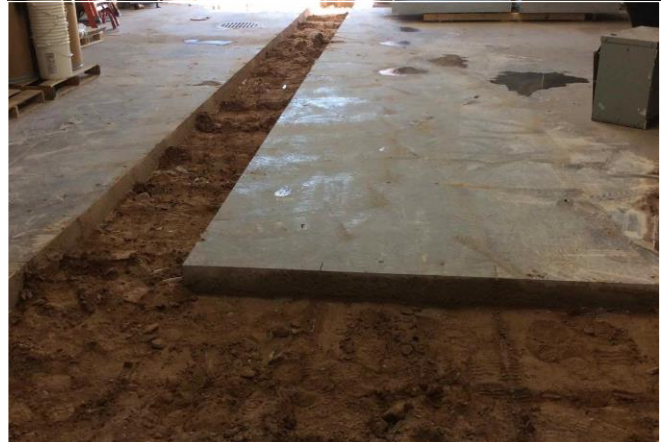
Tech Ed Classrooms