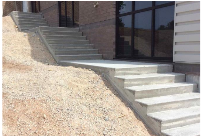
Fitness Center Egress Stair